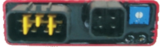
Pic. the front side of Rextor CDI